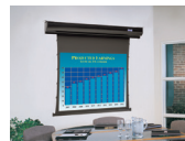
Projection Screens Da-Lite, Draper