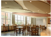
Acoustical Wall & Ceiling System Golterman & Sabo