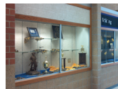
Display/Bulletin Cases Claridge