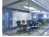
Operable Glass Walls & Partitions Kwik-Wall