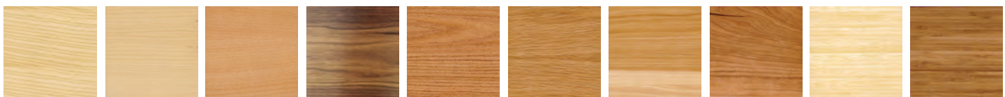
Ash Maple Beech Walnut Red Oak White Oak Hickory Cherry Natural Bamboo Caramelized Bamboo

*Different species may increase production lead time. Natural wood products vary in color and grain. Due to differences in printing, actual color may differ from images above.